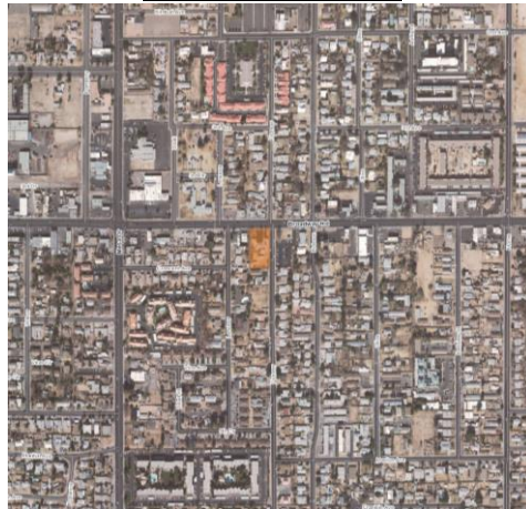
2006 Aerial photo